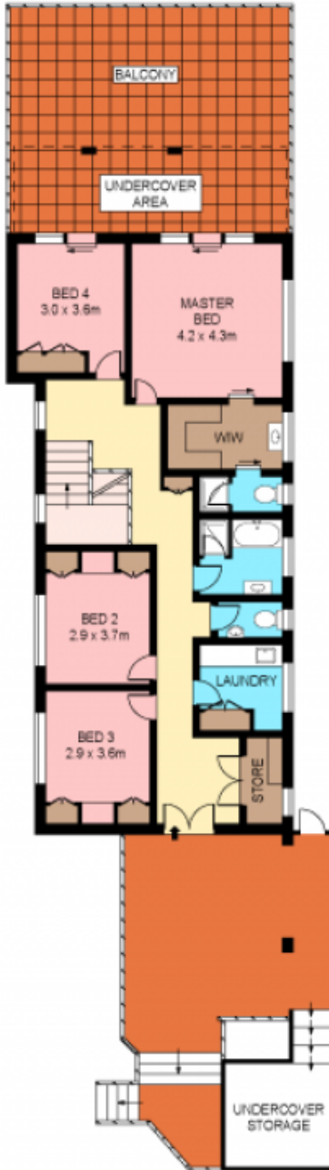
TOP FLOOR/ ENTRY LEVEL