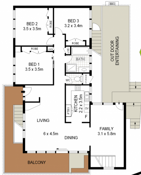
ELEVATED GROUND FLOOR