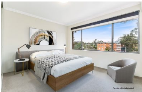
Furniture Digitally Added