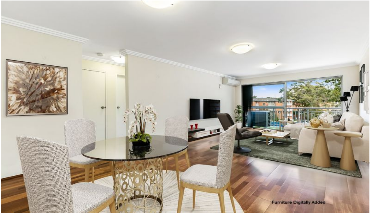
Furniture Digitally Added