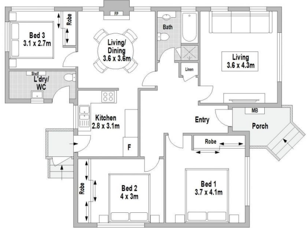
GROUND FLOOR (MAIN RESIDENCE)